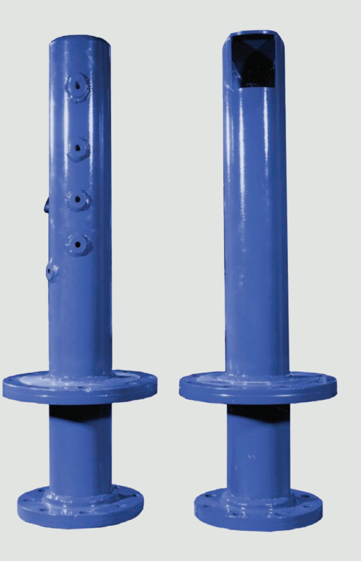
Fixed nozzel and quill take-off.