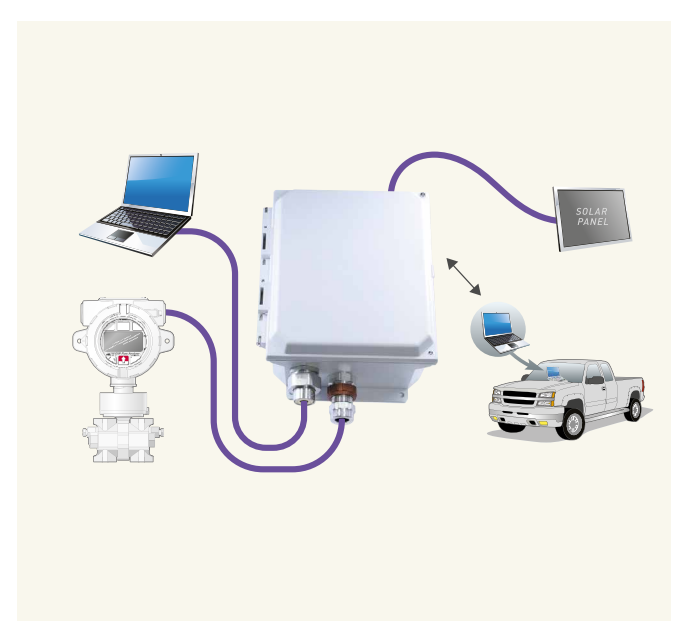
Solar/Wi-Fi Accessory Package