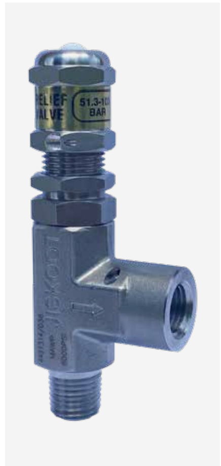
JISKOOT SCV with 1/4" NPT Connections