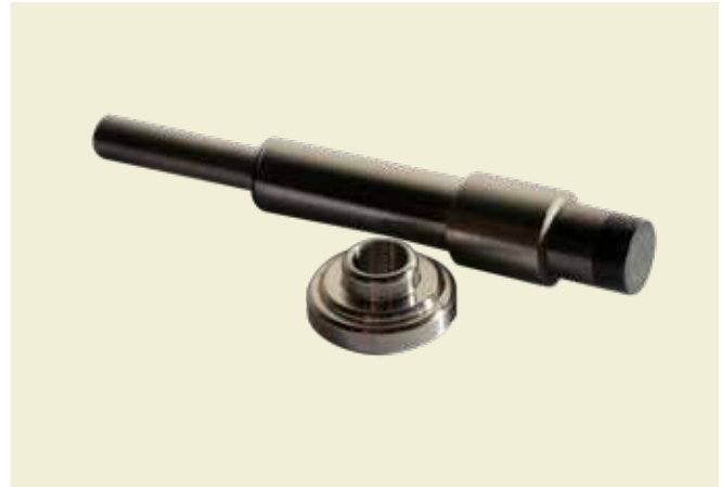
Severe service stem and seat

The JISKOOT SCV for severe service is designed for challenging sampling applications where there are entrained solids or abrasive particulates, which can lead to a reduction in the lifespan of traditional sampling check valves. Proven in severe field trials – specialized stems, seat materials and a customized internal design ensure that this sampling check valve can last three to five times longer than the JISKOOT SCV for rugged service use.