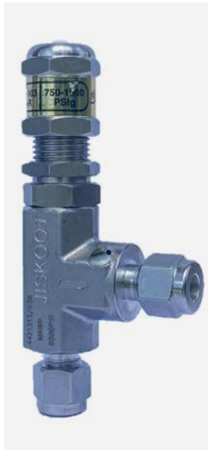
JISKOOT SCV with 1/4" Tubing Connections

With both 1/4" NPT pipe fittings and 1/4" tubing connections, the JISKOOT SCV can easily replace existing valve configurations in sampling applications. JISKOOT SCV valves can be configured to include a variety of optional seal materials to be implemented in either gas or liquid sampling. In addition a conventional safety relief valve can be used in conjunction with the JISKOOT SCV to protect the tubing, switching valves, receivers and other components that are downstream of the sampler.