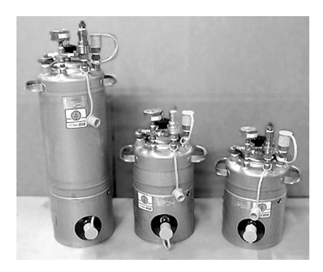
Figure 1—R-Series portable receptacles (from left): R20-4 (5 gallons), R8-4 (2 gallons), and R4-4 (1 gallon).