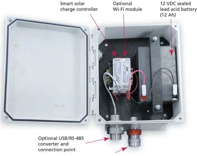
Explosion-proof gland for connection to flow computer in hazardous area

Users can connect to the flow computer via the Division 2 accessory using a standard USB A-B cable and an optional USB port at the bottom of the accessory enclosure.