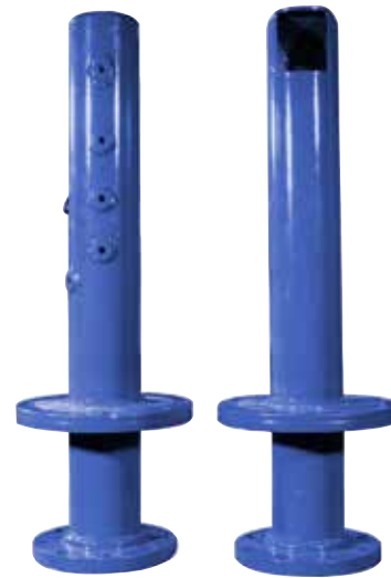
Fixed nozzle and quill take-off

The withdrawable nozzle and quill can be installed by hot-tap into either the top or the bottom of the pipeline. Online analyzers such as water-in-oil monitors and densitometers can be integrated as part of the sampling loop ensuring optimum representativity, accuracy, and direct comparison of results.