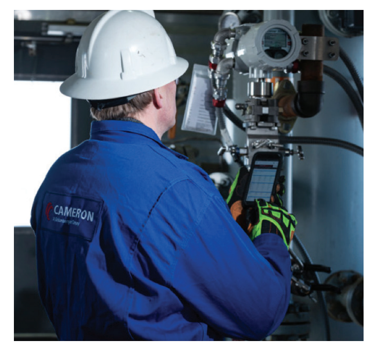
A Scanner 3100 computer in a gas, oil, and water measurement application.

The Cameron system is scalable. A single Scanner 3100 flow computer can compute flow from two separators—each measuring gas, oil, and water—for group separator and test separator applications. This is accomplished